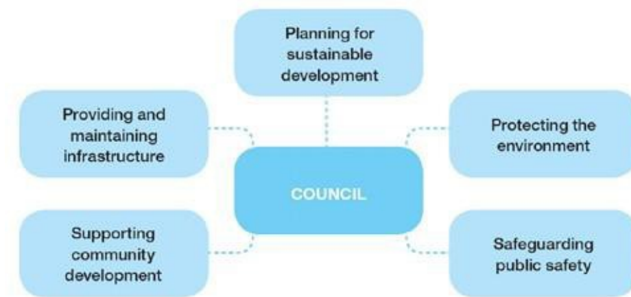
Table 6.1 Shire of Mingenew Functions

The Shire of Mingenew provides a wide range of services and functions. Broadly these may be grouped into 5 categories (see table 6.1).