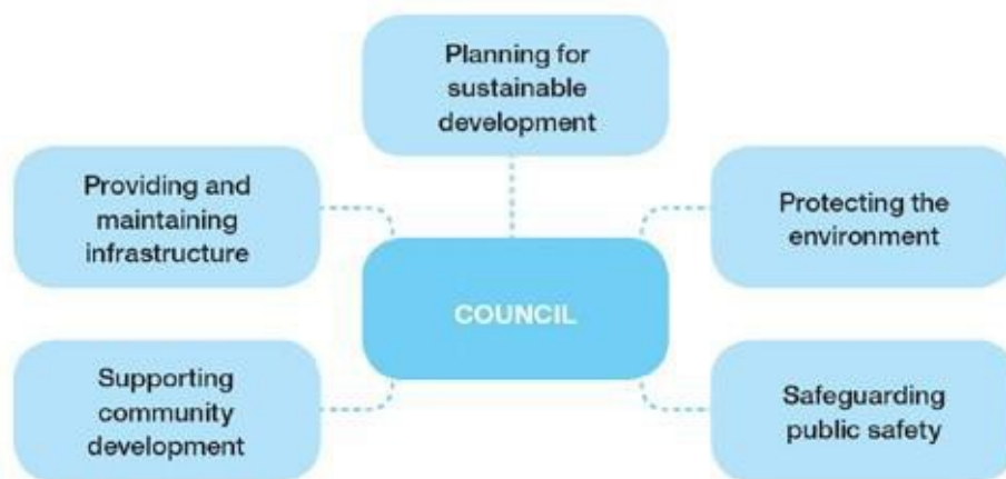
Table 6.1 Shire of Mingenew Functions

The Shire of Mingenew provides a wide range of services and functions. Broadly these may be grouped into 5 categories (see table 6.1).