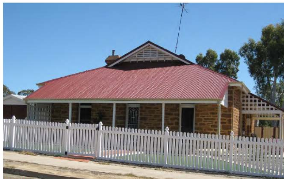
Plate 7 Police Residence