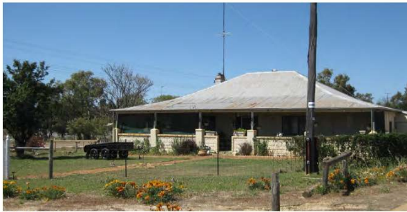
Plate 6 Historic Residence