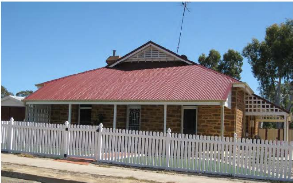
Plate 7 Police Residence