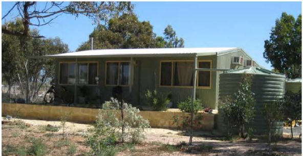
Plate 8 Contemporary Residence