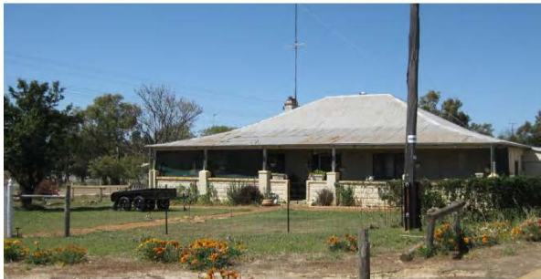
Plate 6 Historic Residence