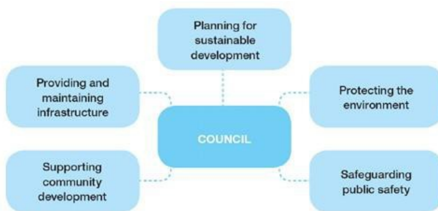
Table 6.1 Shire of Mingenew Functions

The Shire of Mingenew provides a wide range of services and functions. Broadly these may be grouped into 5 categories (see table 6.1).