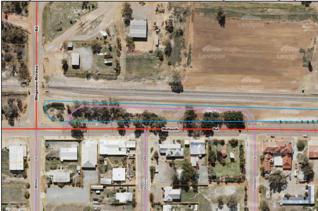
Figure 11.2(b) – Reserve 47995 Midlands Road, Mingenew (parking bay)

86 (Lot 50) Midlands Road, Mingenew is a 1,540m 2 property owned by Michael Ormesher that contains a former service station