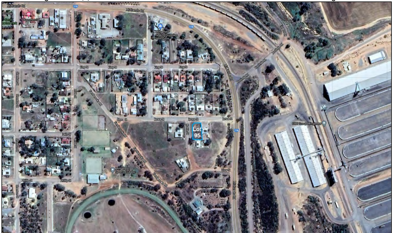
Figure 11.4(a) – Location Plan for Lot 95 corner Wattle & Ikewa Streets, Mingenew

Lot 95 is an 817m 2 property located on the south-east corner of the Wattle and Ikewa Street intersection.