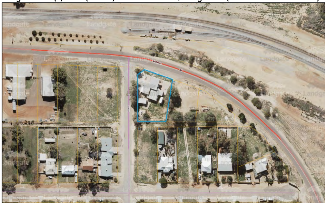
Figure 11.2(c) – 86 (Lot 50) Midlands Road, Mingenew (former service station)

Reserve 900 Coalseam Road, Holmwood (Coalseam Conservation Park) is a 753.8343ha Crown Reserve with a management order for 'Conservation Park' issued to the Department of Biodiversity, Conservation & Attractions.