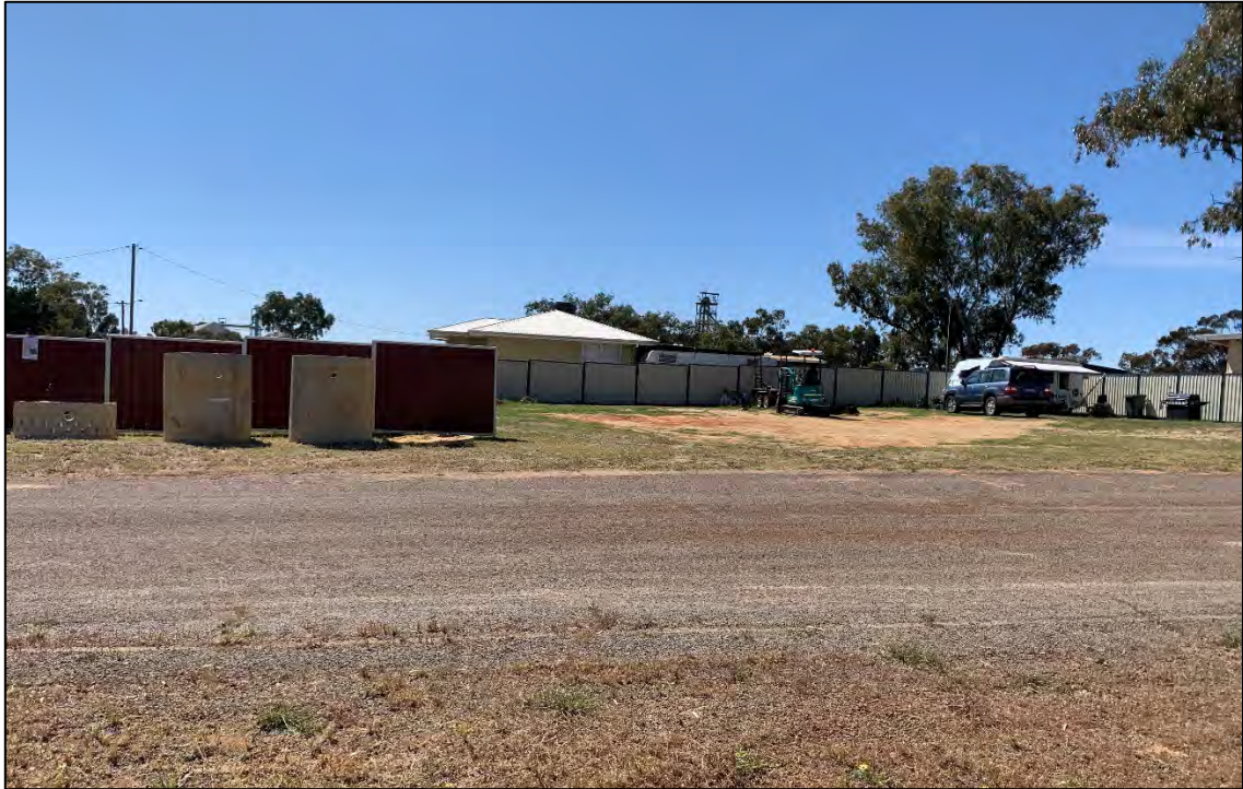
Figure 11.1(c) – View looking east at Lot 95 from Wattle Street

Council previously refused an application to construct a shed prior to a residence upon Lot 95 at its 19 June 2019 meeting.