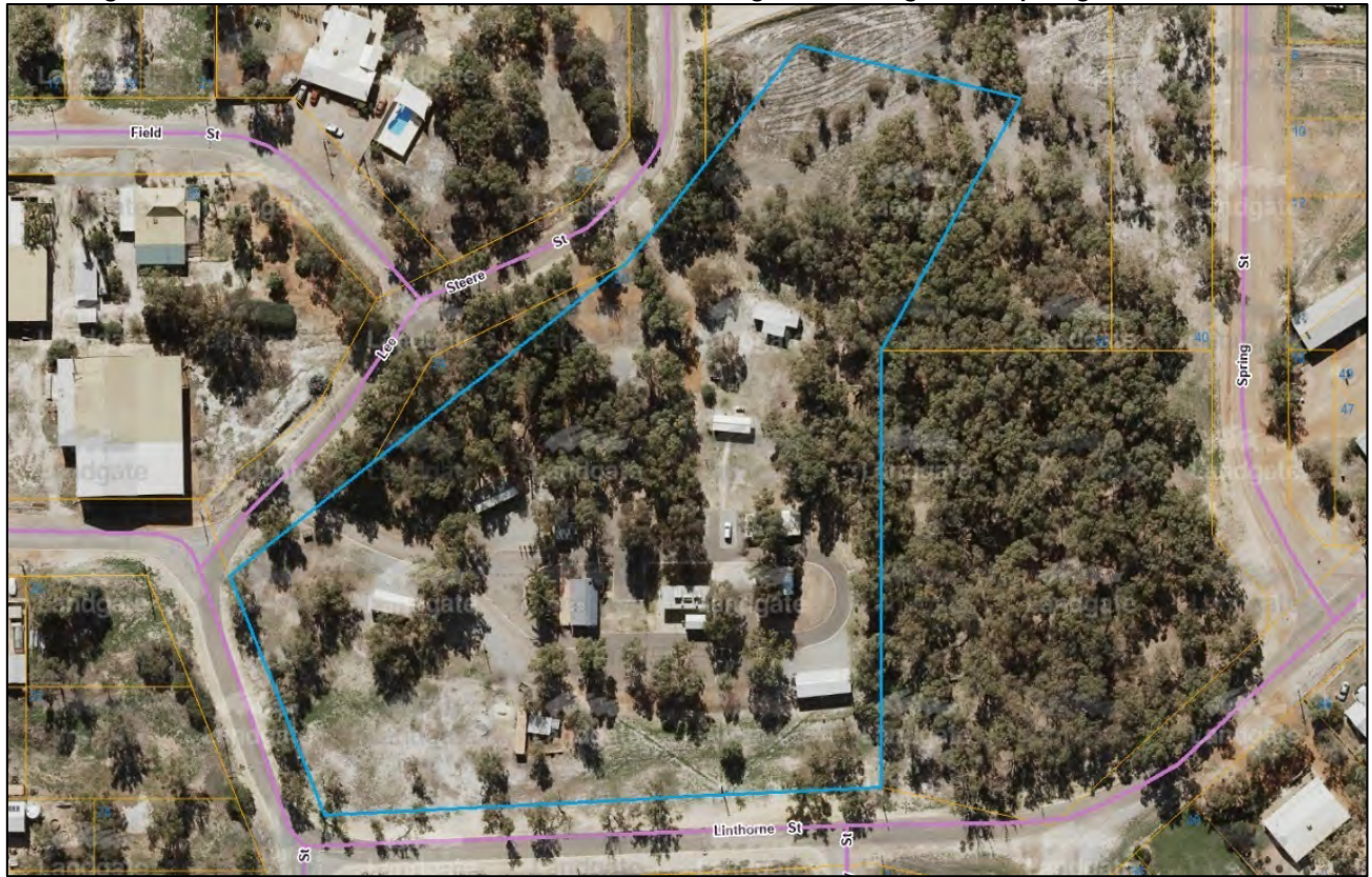
Figure 11.2(a) – 20 (Lot 267) Lee Steere Street, Mingenew (Mingenew Spring Caravan Park)

Reserve 47995 Midlands Road, Mingenew is a 2.3493ha Crown Reserve that contains a car parking area with a management order for 'Civic Purposes' issued to the Shire of Mingenew. The applicant is proposing to site the food & coffee van at this location only on Sunday afternoon when the Mingenew Bakery is closed for business.